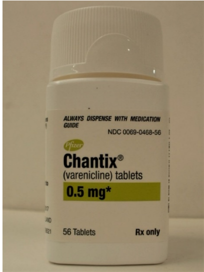
Chantix (varenicline) Tablets 0.5 mg Tablets